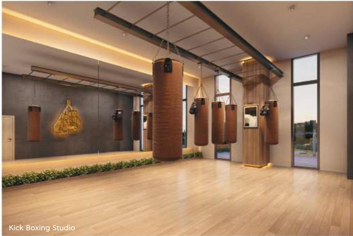
Kick Boxing Studio