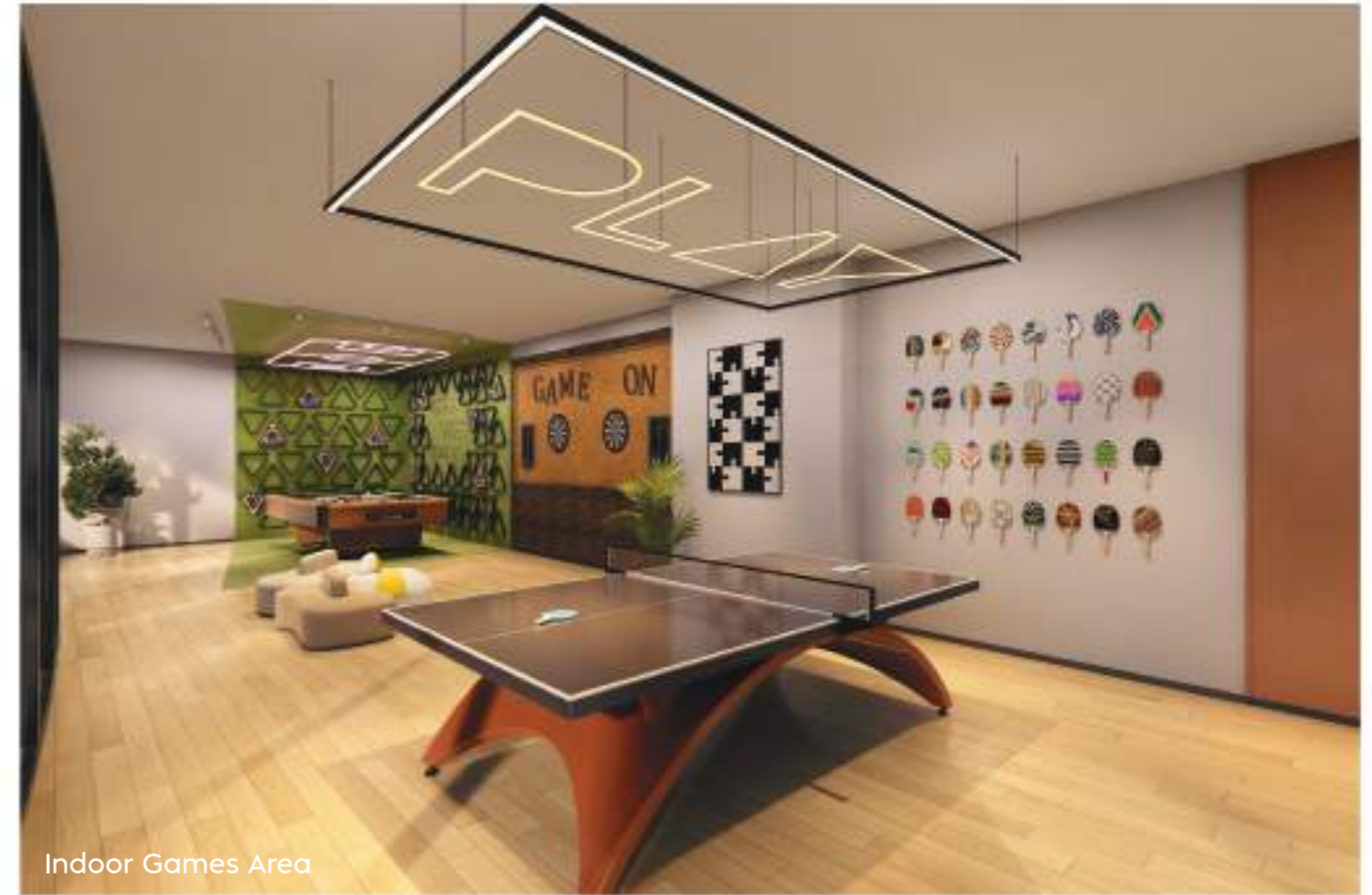
Indoor Games Area