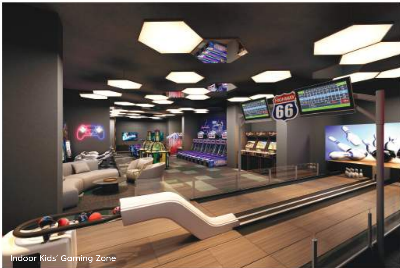
Indoor Kids' Gaming Zone