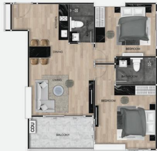
2B-C 72 sq.m.