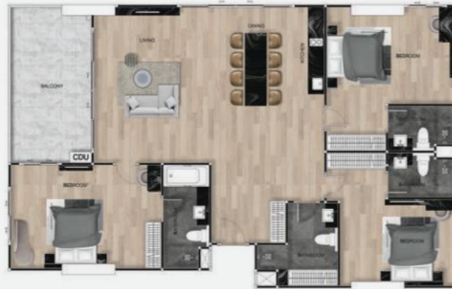
3B-B 160 sq.m.