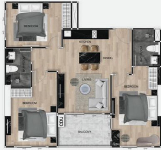
3B-A 76 sq.m.