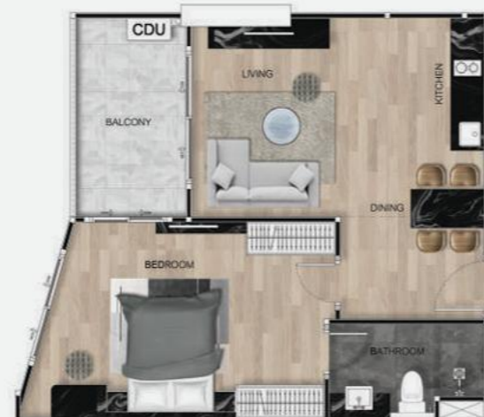
1B-B 54 sq.m.