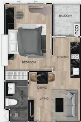
1B-A 34 sq.m.