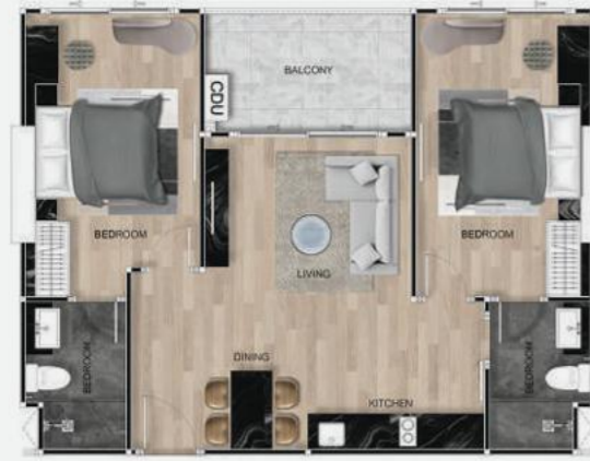
2B-B 68 sq.m.